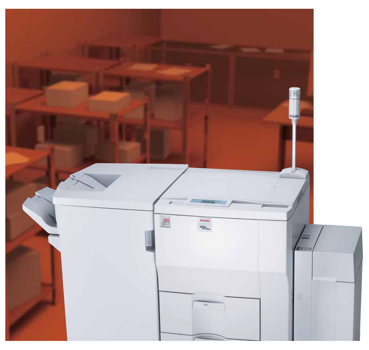
Aficio SP 9100DN