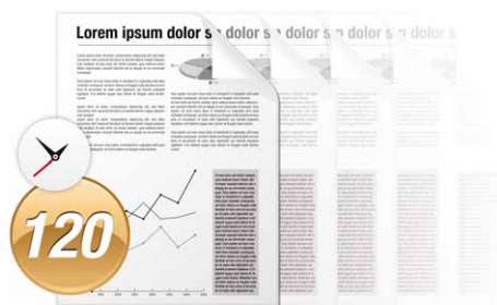
Prints per minute

Everyone will save time with the two simple to change consumables and easy swap optional colour drum units. The user friendly LCD control panel gives instant access to all functions and adding paper and removing prints is simplicity itself, so virtually anyone can operate the DX 4542. Combined with an impressive speed of 120 prints per minute (ppm), it boosts productivity by making it easy to rapidly produce your volume documents.