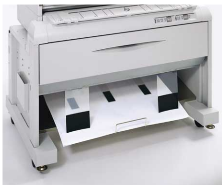
You can make up to 10 copies and deliver them to the front thanks to the FW780's Copy Tray.

You can depend on the FW780 for cutting your copies at the right length. Simply put in your original and it will be cut automatically with the Synchro Cut function. No more manual setting and cutting. Your copies are there waiting when you need them.