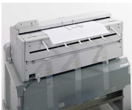
Thick or paste-up originals are fed in a single pass through the FW780's rear feeder.