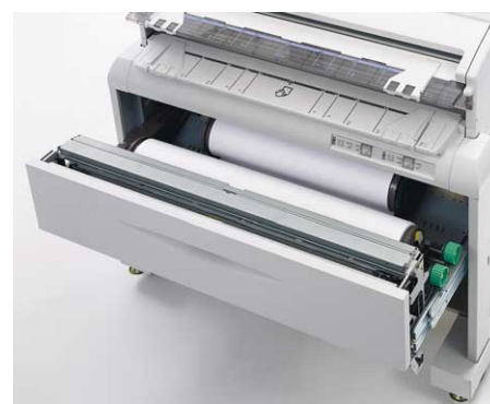
With the FW770/780's optional 2 roll feeder, 2 types of paper are available at the touch of a button.